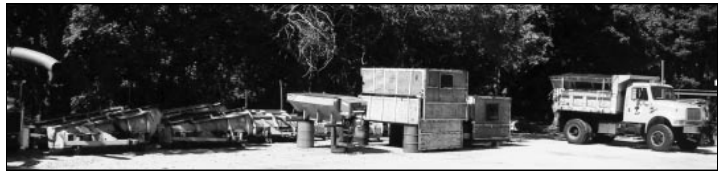
The Village fall and winter equipment is now neatly stored in the newly created storage area.

In the past, trees and brush that had been removed during the previous year were carted away at an extra expense to the Village. This year, the trees and brush have been turned into wood chips eliminating the cost of removal while providing them free of charge to our residents. As the leaves begin to fall, please remember to drive carefully and always watch out for children playing in the leaf piles.