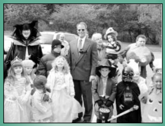
Village of Farmingdale Mayor George Graf (center) with some of the marchers at the beginning of the Parade.