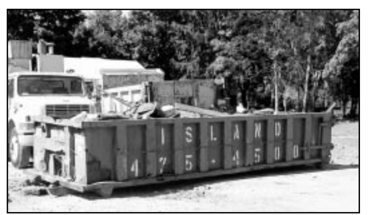
One of the many dumpsters of debris removed from the Ridge Road facility.

The main DPW facility at Ridge Road underwent a massive clean-up effort costing village taxpayers over $100,000 to remove hazardous waste and material in addition to yards of refuse (10- ten yard dumpsters) that was allowed to build up over the past decade plus. The main garage because of the years of neglect is in need of a complete electrical overhaul, installation of heating, and a new roof. The Board will be carefully reviewing the most economically feasible ways to make these repairs while taking into consideration the future needs of the department and what new technology exists to make the building more efficient. The board also, after reviewing the department, instituted changes that resulted in an annual savings of over $200,000. You can rest assured that we will continue to monitor and evaluate the needs and performance of every department to assure that they are performing up to par, within budget while providing the highest level of service.