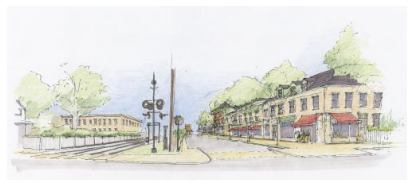
An artist rendering of what South Front Street could look like in the future.

ation and teamwork that took place. While opinions on what was good and bad, what should be changed or left alone varied, the resounding message was clear, Farmingdale is a great place to live and many people share the vision of the administration wanting to see it get better for the future. There were many excellent ideas presented - ideas that will be examined and considered very seriously as the Board develops our master plan. I hope all those who participated will continue to stay involved in the process by coming to the future visioning meetings as well as our trustee meetings. The future plans of Farmingdale are off to a great start thanks to Vision Long Island and the special group of stakeholders who took part.