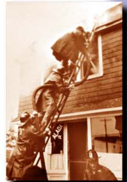
WATER WITCH ENGINE CO. located on Main Street now the McCourt & Trudden Funeral Home

Generations of Farmingdale residents have served faithfully and valiantly as volunteers to save lives and protect property for almost 125 years as members of the Farmingdale Fire Department, but their service goes far beyond firefighting and emergency medical service. The members of our fire department take great pride in their village, its quality of life, and its heritage. Significant community traditions such as the Memorial Day Parade and Columbus Day Weekend Fair are chiefly the work of the Farmingdale Fire Department. Its role forms a major strand in the fabric of Farmingdale community life, as it has since the 1880s.