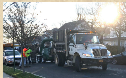
DPW Crew cleaning up leaves - thanks for a great job men!

Standard & Poor's Rating Services has reaffirmed the Village's "AA" long term bond rating, the highest in Village history, when the Village authorized the issuance of $4,800,000 in bonds for water and road improvements. This rating indicates a very strong capacity to meet financial commitments.