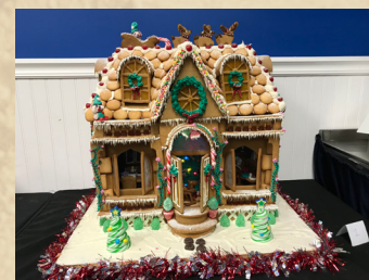
Cultural Arts Gingerbread House Contest - House on left was awarded 1st prize and the house on the right was the People's Choice winner! Contratulations!!