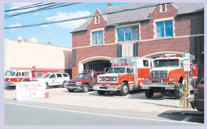
The FFD held it's annual open house on October 8th.

If your Smoke detector or Carbon Monoxide detector