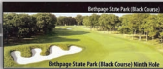
Bethpage State Park (Black Course) Ninth Hole

A new law was enacted due to the many complaints received in 2002 re: people parking cars on their front lawn. Not only was this extremely dangerous but it was unsightly. Here is the law: In a residential district, there will be no parking of automobiles, temporarily or otherwise, on lawns except when there is a declared emergency. A violation of this provision shall result in a fine of $350.00 per vehicle parking on a lawn.