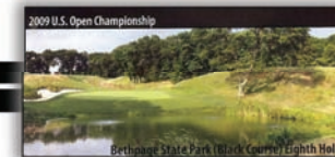
Bethpage State Park (Black Course) Eighth Hole

All Farmingdale residents with US Open tickets are encouraged to walk to the train station, go through security and take a short bus ride to the Open. On Saturday and Sunday, we have a free trolley for ticket holders to go from the train to Howitt Middle School and back. The trolleys will run from 7:00 am to 7:00 pm with stops along Main Street.