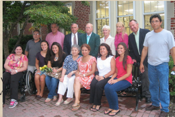
The Crespo family has dedicated a bench in Village Green in memory of [redacted]; beloved son, brother, uncle.