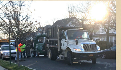
DPW Crew cleaning up leaves - thanks for a great job men!

I am hoping that the Spring will once again allow us to gather and plant and bring a renewed sense of life to the village. Until then, be safe, be healthy and wear a mask.